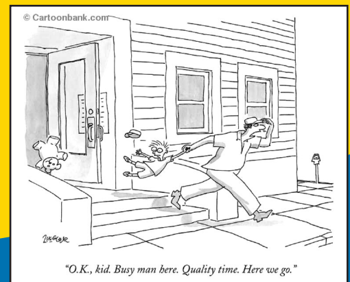
"O.K., kid. Busy man here. Quality time. Here we go."